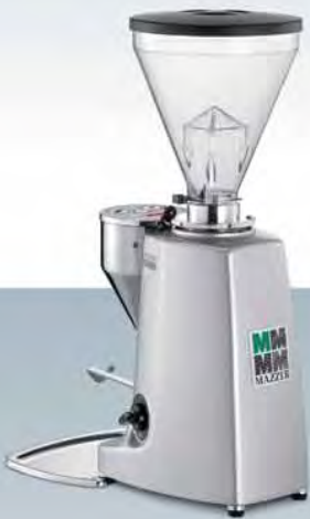
SUPER JOLLY ELECTRONIC

Zuccarini ESPRESSO MACHINES AND COFFEE BAR SYSTEMS WWW.ZUCCARINILT.D.COM (416) 537-3439